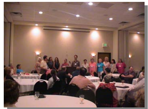
PPDA Professional Program Directors Association