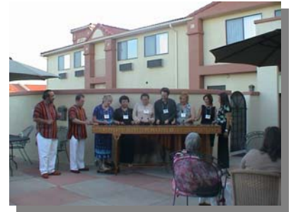
Conference attendees with The NM Marimba Band