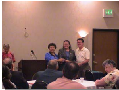
Program of the Year - Deming Literacy Program